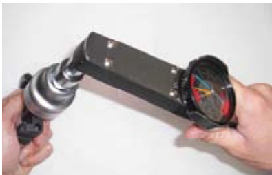
Example : KEO Sprint pedal

With aid of a torque wrench, in the direction as indicated the arrow on the lock-nut, screw the lock-nut of the axle into the pedal body. Limit torque to 5Nm (3.7 ft-lbs).