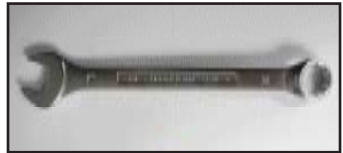
KEO Carbon/HM 18mm box wrench

For KEO carbon and KEO carbon HM pedals, use an 18mm box wrench