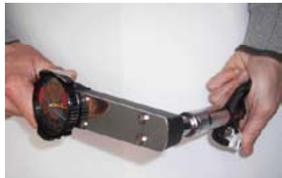
Example : KEO Carbon pedal