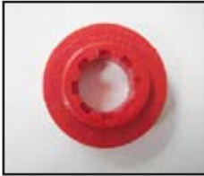
KEO Classic/Sprint axle tool

For KEO Classic and Sprint pedals, use the red tool provided in the kit.